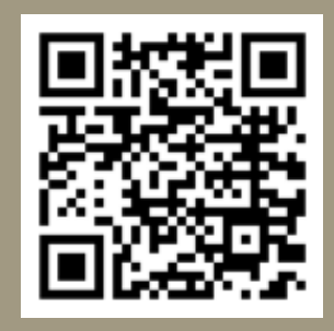
Visit our intake form by scanning the QR code above to get your soil quote started today.